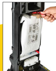
FILTER INSTALLATION IS A BREEZE Removal-system allows a nearly dust free filter bag change and opens with an easy to operate pivoted lever.