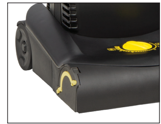
CHANGEABLE ROLLER BRUSH Requires no tools and allows hairs, threads, etc. to be removed quickly and easily.