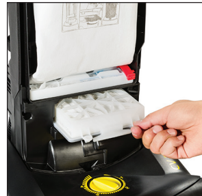
3-STAGE FILTRATION The filtration system includes a disposable filter bag, an intake filter, and a HEPA filter cartridge.